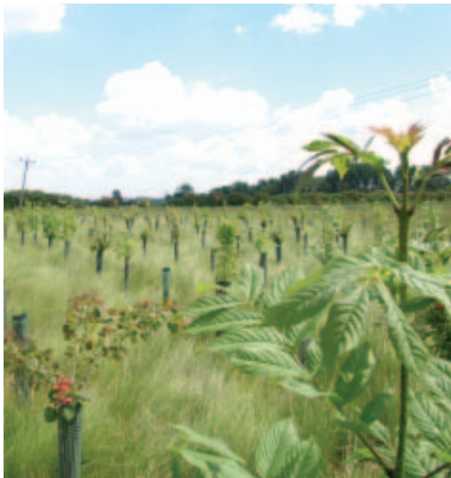
Providing 'green infrastructure' as part of new development is an important consideration in the planning process. Marston Vale Community Forest, Bedfordshire.

Plans and strategies should be deliverable and show how objectives should be achieved. An example is the use of planning obligations and other delivery mechanisms to implement the spatial policies. Individual development proposals could be required to make a practical contribution in cases where it is located in or close to the relevant area or it could include proposals of a type that could contribute to the target. Other developments may make indirect contributions such as assisting with the funding of projects.