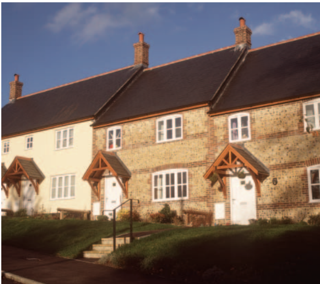
Simsay Fields, Cerne Abbas, Dorset.