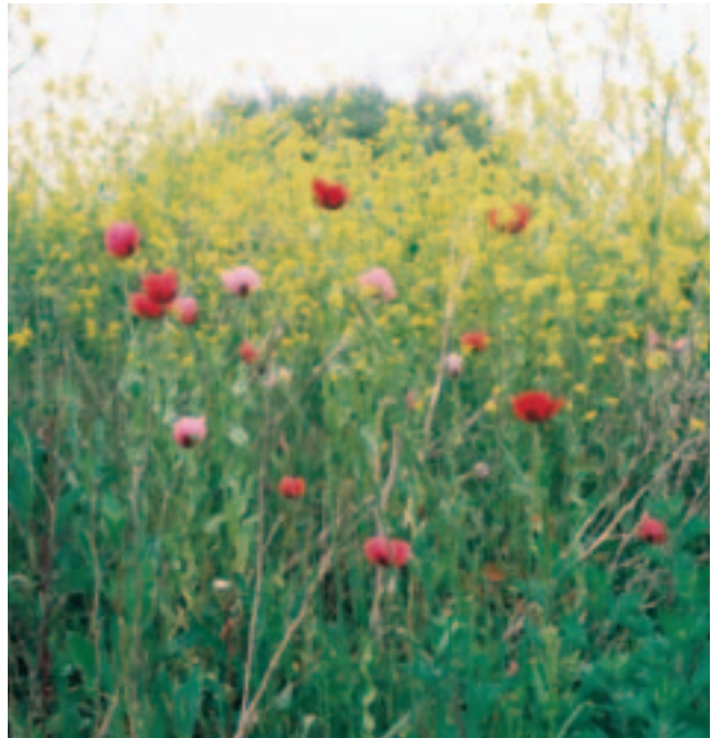
Brownfield sites at Canvey Wick, Canvey Island, where a win-win-win solution was achieved. See Supplementary File 5.

Some of the ‘crunch issues’ that RSS and LDF documents will need to face up to, such as accommodating new housing in sensitive areas, will mean that aspects of the environment may be depleted. But all development is capable of delivering benefits as well as fully mitigating and compensating for environmental harm. The agencies believe that the best way of planning for these scenarios is to adopt the sequential approach to decisions illustrated in Figure 2 .