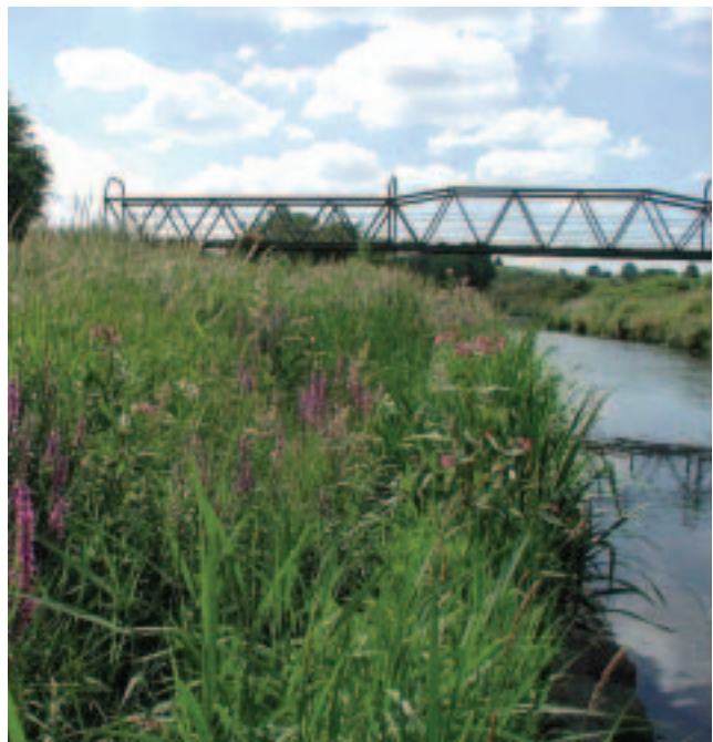
The River Whitton after bioengineering work to stabilise the banks. 'Soft' solutions should be considered instead of 'hard' engineering often used in new development.

Supplementary File 9 gives further guidance on these aspects of sustainable development.