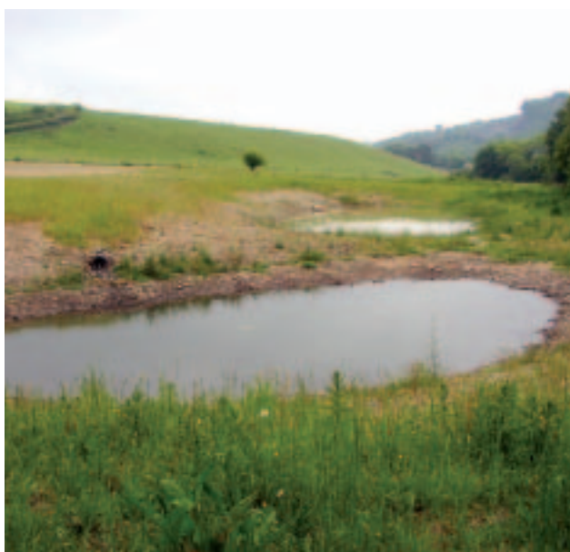
A pond, wetland, flood storage compensation for a small housing development near Buckfastleigh. Environment Agency