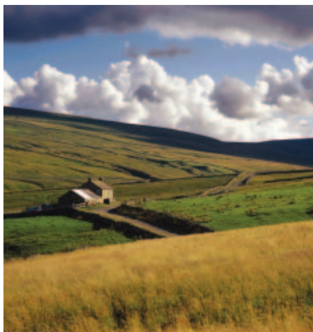
Moorland near Langdon Fell, Ireshopeburn, Northumberland.

Development also needs to take full account of future impacts, particularly the effects of climate change and how the capacity of an area, such as coastal zones and river valleys, may change with rising sea levels, increased rainfall, increased storminess and other potential changes in weather patterns.