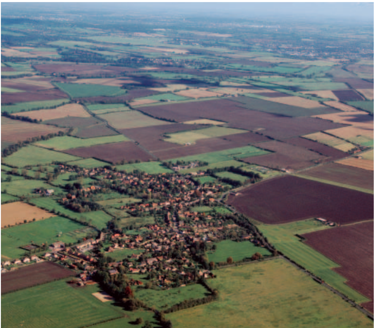
Historic environments need to be protected from new development through the planning system. English Heritage

Objectives should not be a vague wish-list but a clear statement of what needs to be done to deliver outcomes such as facilitating sustainable development, what needs to be conserved; and what should be replaced, improved or restored. Of particular importance in establishing conservation needs is 'critical natural capital' and historic areas and features that, if lost or spoiled, can never be replaced. Examples are ancient semi-natural woodland, genetically unique populations of species, old field systems, historic parks or gardens, natural river or coastal systems and groundwater resources. Figure 3 illustrates the way in which the agencies see objectives leading policies and proposals in plans and strategies. Supplementary File 7 further explores the objectives-led approach.