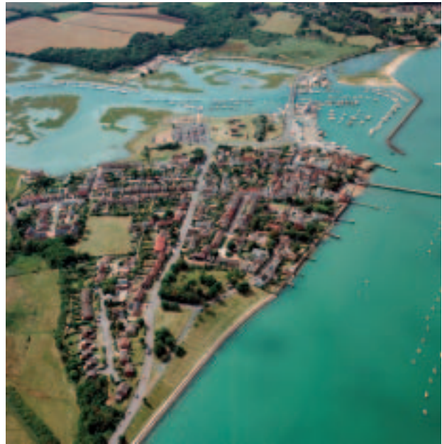
The settlement of Yarmouth on the Isle of Wight contains a large number of historic buildings. The central core is designated as a conservation area and much of the adjacent estuary is designated as a Site of Special Scientific Interest. English Heritage

This guidance is produced by the Countryside Agency, English Heritage, English Nature and the Environment Agency (the agencies) to help planning authorities and regional planning bodies in preparing plans and strategies under the new planning system. It will also be used by the agencies' own staff. It is intended to supplement guidance issued by the Office of the Deputy Prime Minister (see Supplementary File 1 ).